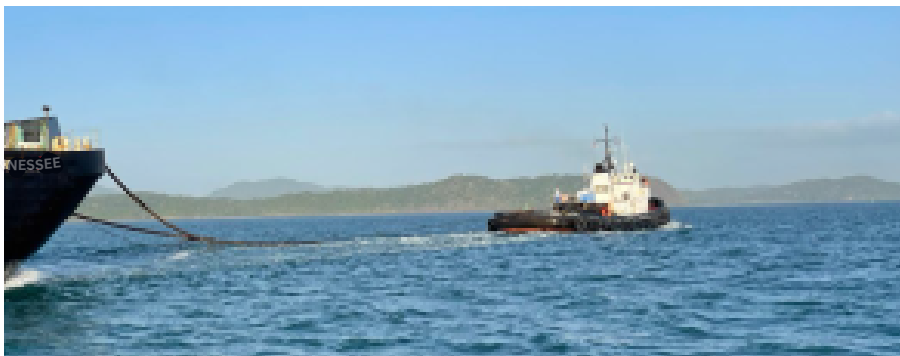
Together, Lobo Grande II and Tennessee form a strong, unified team supporting the transport of petroleum products along a vital corridor in Puerto Rico's energy distribution chain.

Even more significantly, Tennessee now operates unmanned when in duction with Lobo Grande II . This means no crew is required aboard the barge during transit - a set up that results in substantial savings in manpower and operational costs, while maintaining high safety and performance standards.